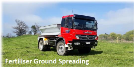
Fertiliser Ground Spreading