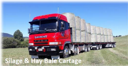
Silage & Hay Bale Cartage