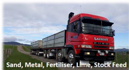
Sand, Metal, Fertiliser, Lime, Stock Feed

Livestock, Groundspreading & General Rural Transport